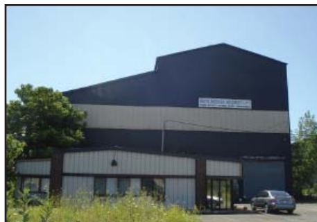
5137 Bleigh Avenue Philadelphia, Pennsylvania

Warehouse/Office/Distribution 264,000 SF