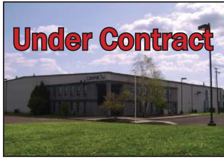
180 Penn Am Drive Quakertown, Pennsylvania FOR SUBLEASE Manufacturing/ Warehouse/Office 37,660 SF