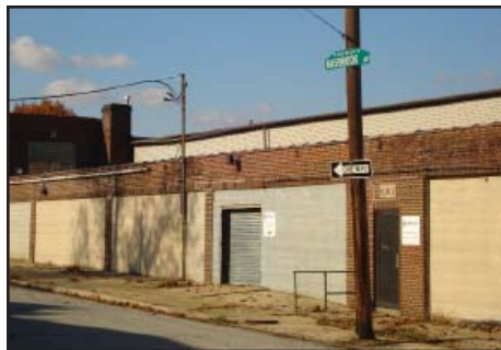
6610 Hasbrook Avenue, Building 2 Philadelphia, Pennsylvania FOR LEASE Single story building 21,000 SF