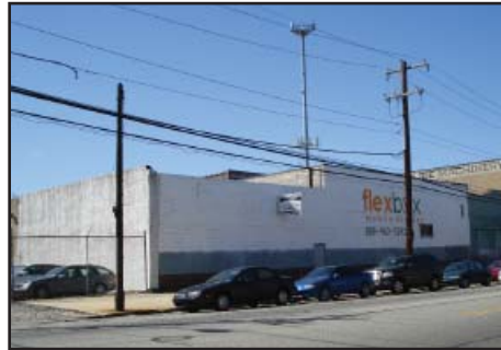
1224-36 Belmont Avenue Philadelphia, Pennsylvania

Industrial building +/-7,000 SF industrial building plus 1,000 SF mezzanine office space