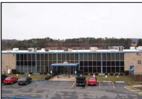
210 Industrial Park Road Elysburg, Pennsylvania

Warehouse/Office/Distribution 264,000 SF