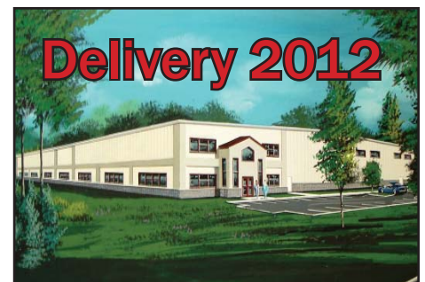
Northfield Business Campus Quakertown, Bucks County, PA

Warehouse 26,000 SF Also available for lease