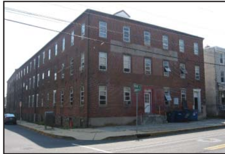
103 South Main Street Quakertown, Pennsylvania FOR LEASE Flex/Manufacturing 2,000 SF - 24,000 SF