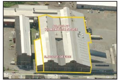
200 C Furnace Street Birdsboro, Pennsylvania FOR LEASE Warehouse/Manufacturing/Distribution 20,000 SF - 60,000 SF