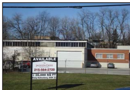
2536 S. 59th Street Philadelphia, Pennsylvania

Warehouse 26,000 SF Also available for lease