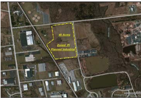
East Pumping Station Road Richland Township, Bucks County, Pennsylvania

Industrial Investment Sale 100% Occupied