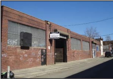
3370 Collins Street, Philadelphia, Pennsylvania

Industrial building +/-7,000 SF industrial building plus 1,000 SF mezzanine office space