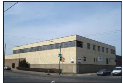
949 East Erie Avenue Philadelphia, Pennsylvania FOR LEASE Fit-out to suit +/- 32,000 SF