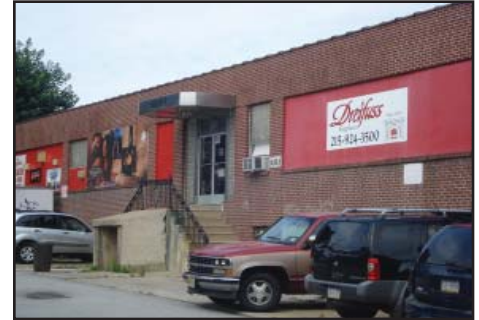
6610 Hasbrook Avenue Philadelphia, Pennsylvania

Industrial Investment Sale 100% Occupied